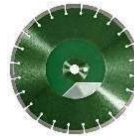
Green Concrete Blade