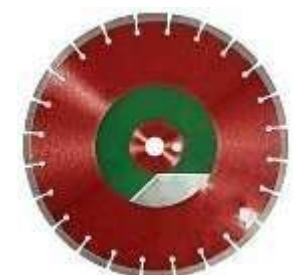
Reinforced Concrete Blade